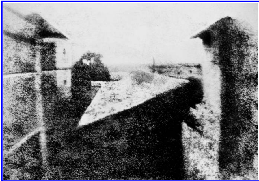
FIGURE 2. Joseph Nicéphore Niépce, View from the Window at La Graz , 1826.

Indices are signs of presence, but this presence is not necessarily spatial or physical; it is, however, always temporal. Though one may encounter the indexical sign after the fact , as with the photograph or footprint, indices are always created simultaneously with the action or event that they indicate. 31 The centrality of temporal copresence may not seem evident in relation to indices that are physical marks of past encounters, but it becomes apparent with other examples that Peirce evinces, ones that do not leave permanent "material traces" or occur in the past: a pointing finger indexes something